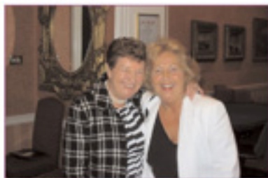
Our very own Golden girls!

Yes Roy, we've all wanted to strangle Conor at one time or another!